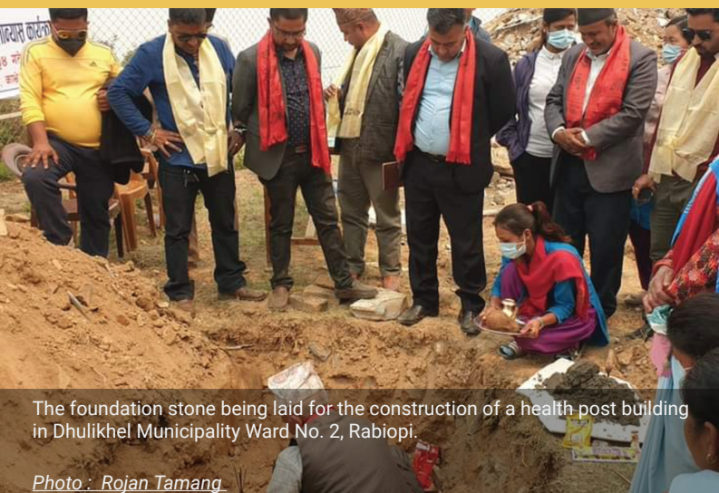
The foundation stone being laid for the construction of a health post building in Dhulikhel Municipality Ward No. 2, Rabiopi.