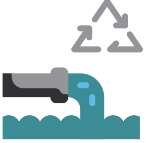
Report burst pipes to your local council office