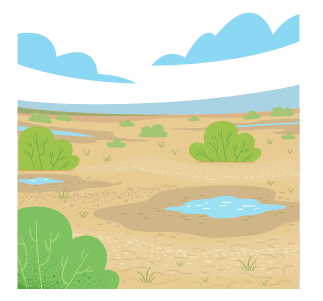
Preserve wetlands- do not build on wetlands